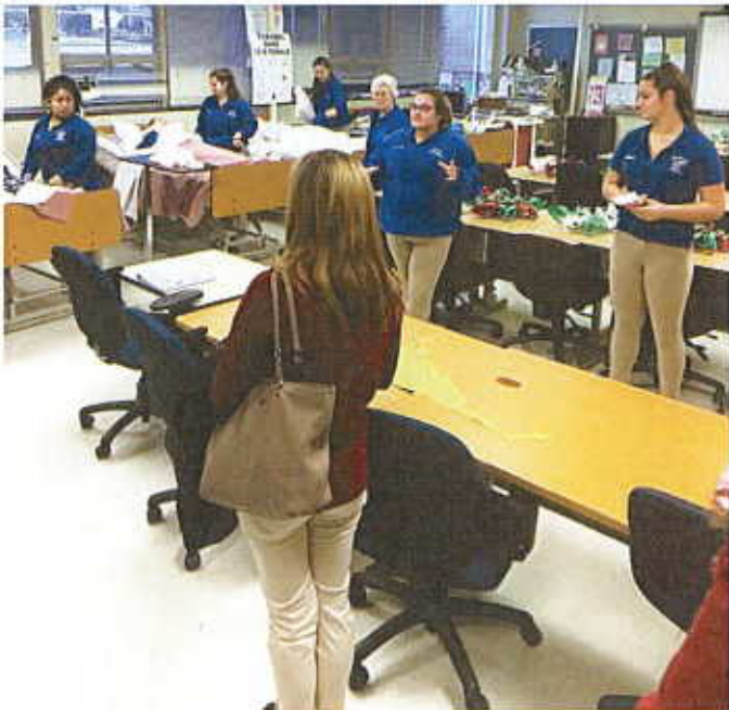
Oliver Wolcott Technical School's Health Technology students hosted the Chamber's Health Council on December 19th. Members of the Council heard a presentation on the program from two of the students who then provided a tour of the learning space.

Torrington 860-482-3506 Lakeville 860-435-2507 Rocky Hill 860-225-7721 assuredpartnersNE.com