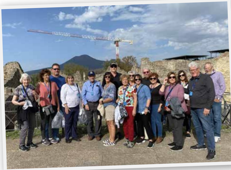
In November, a group of 16 travelers went to the Amalfi Coast and Rome as part of the Chamber's Travel Program.