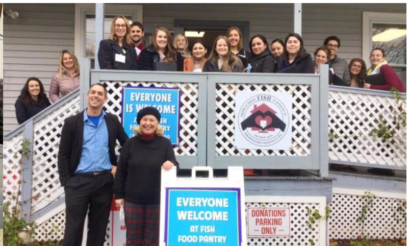
FISH/Friends in Service to Humanity of Northwestern Connecticut

On Wednesday November 16th, our Leadership Northwest class visited FISH, the Winsted YMCA, and the McCall Center for Behavioral Health. It was our Social Service session and the mission was to expose the attendees to some of the many social service organizations in Northwest Connecticut, and to gain knowledge and understanding of issues affecting our region.