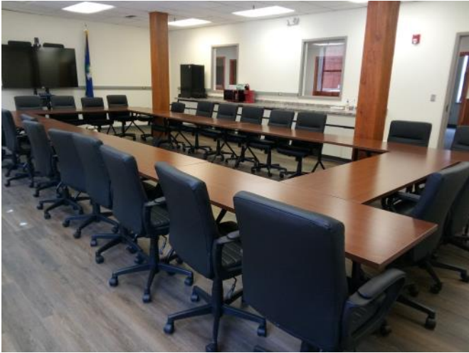
Conference Room - Conference Style (seats up to 28)