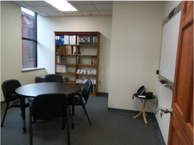
Library - (Seats up to 6)