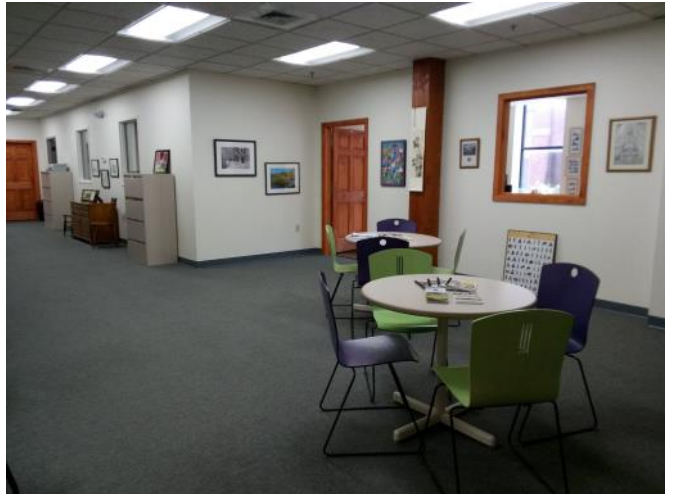
Reception Area - (Seats up to 8)

Member Room Rates: 8 am – 5 pm, $35 for the 1 st hour, $20 per hour thereafter 5 pm – 10 pm, $45 for the 1 st hour, $35 per hour thereafter