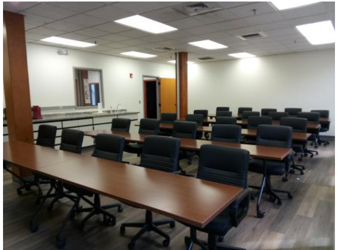
Conference Room - Classroom Setup (seats 20-25)