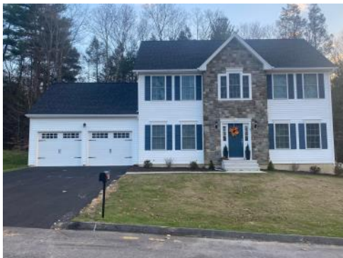
Tognalli Drive, Torrington