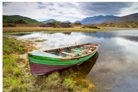
Killarney National Park

Get ready for the adventure of a lifetime with the NW CT Chamber of Commerce to Ireland for THE IRISH SPIRIT .