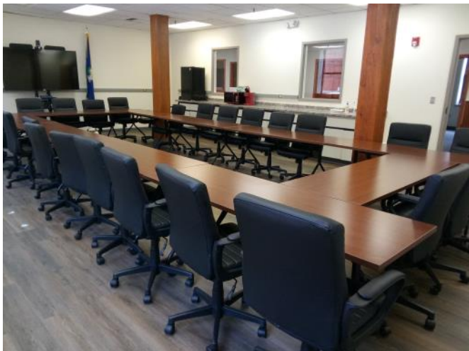
Conference Room - Conference Style (seats up to 28)