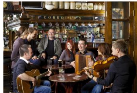
Connolly's Pub, Dublin