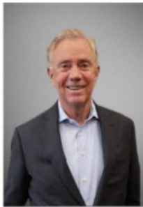
Governor Ned Lamont